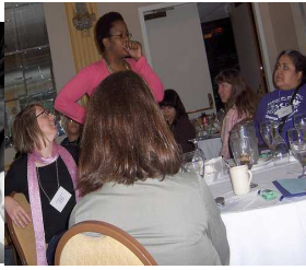
ATL leader speaks up @ ALC