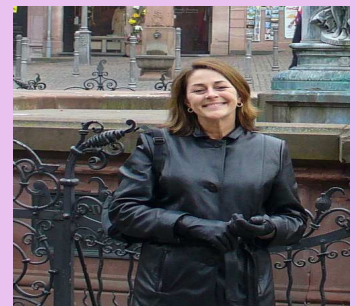
"Working adults should make enough to lift their families out of poverty."

to be a part of 9to5's work, and looks forward to fighting for better policies for working families.