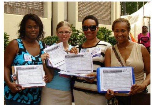
9to5 Atlanta members collected over 220 signatures in support of the Healthy Families Act.

On August 26, Atlanta 9to5 members participated in a nationwide effort to raise awareness and support for paid sick days legislation The Healthy Families Act (HR 2460/SB 1152). During the Paid Sick Days Now! Day of Action, Atlanta 9to5 turned out 13 members on their lunch hour to canvass and educate voters about